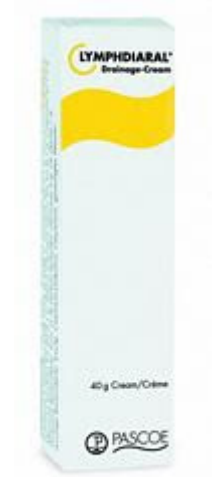
Lymphdiaral Cream - £19.98

We stock a hand-picked range of creams which are natural and free of any nasties, to support the wellbeing of your patients. So we thought it was time to shine the light on two of them as a reminder of their wonderful properties.