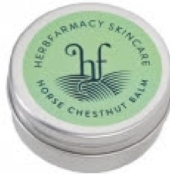
Horse Chestnut Balm - £9.98