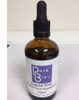
Liquid Zinc £8.12