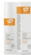
Self Tan Lotion £21.00